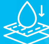
Post Carbon + Mineral Add-Back Filter

Reduces dissolved solids, pharmaceuticals, and metals.