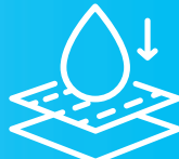
Dual Reverse Osmosis Membranes

Reduces chlorine, chemicals, and pesticides.