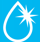
Post Carbon Filter

Adds minerals, electrolytes, and enhances alkalinity.