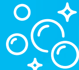
BIO-SURE PLUS™ Filter

Reduces dissolved solids, pharmaceuticals, and metals.