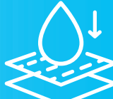
Reverse Osmosis Membrane

Reduces chlorine, chemicals, and pesticides.