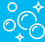
BIO-SURE PLUS™ Filter

Reduces dissolved solids, pharmaceuticals, and metals.