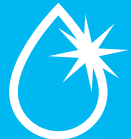
Post Carbon Filter

Adds minerals, electrolytes, and enhances alkalinity.