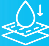
Reverse Osmosis Membrane

Reduces chlorine, chemicals, and pesticides.